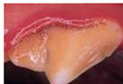
GRADE II Moderate gingivitis <25% bone loss Swollen gums Odor is noticeable