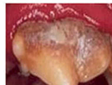
GRADE III Severe gingivitis >25% bone loss Gingival recession Sore mouth May be irreversible