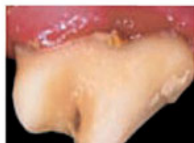
GRADE I Mild gingivitis/redline No bone loss Reversible changes