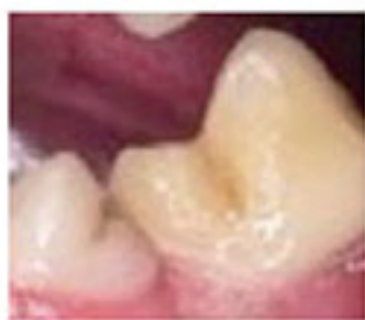
GRADE 0 Normal Some plaque No bone loss