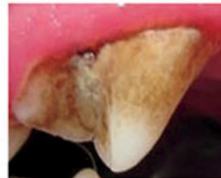
GRADE III Moderate tarter Tartar covers 50-80% of tooth