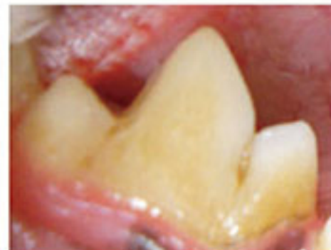
GRADE II Moderate plaque Tartar covers <50% of tooth