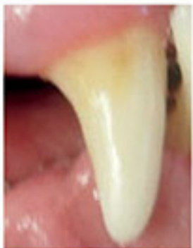
GRADE I Normal Mild plaque present No Tartar