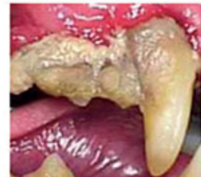
GRADE IV Severe tartar Tartar covers 80-100% of tooth